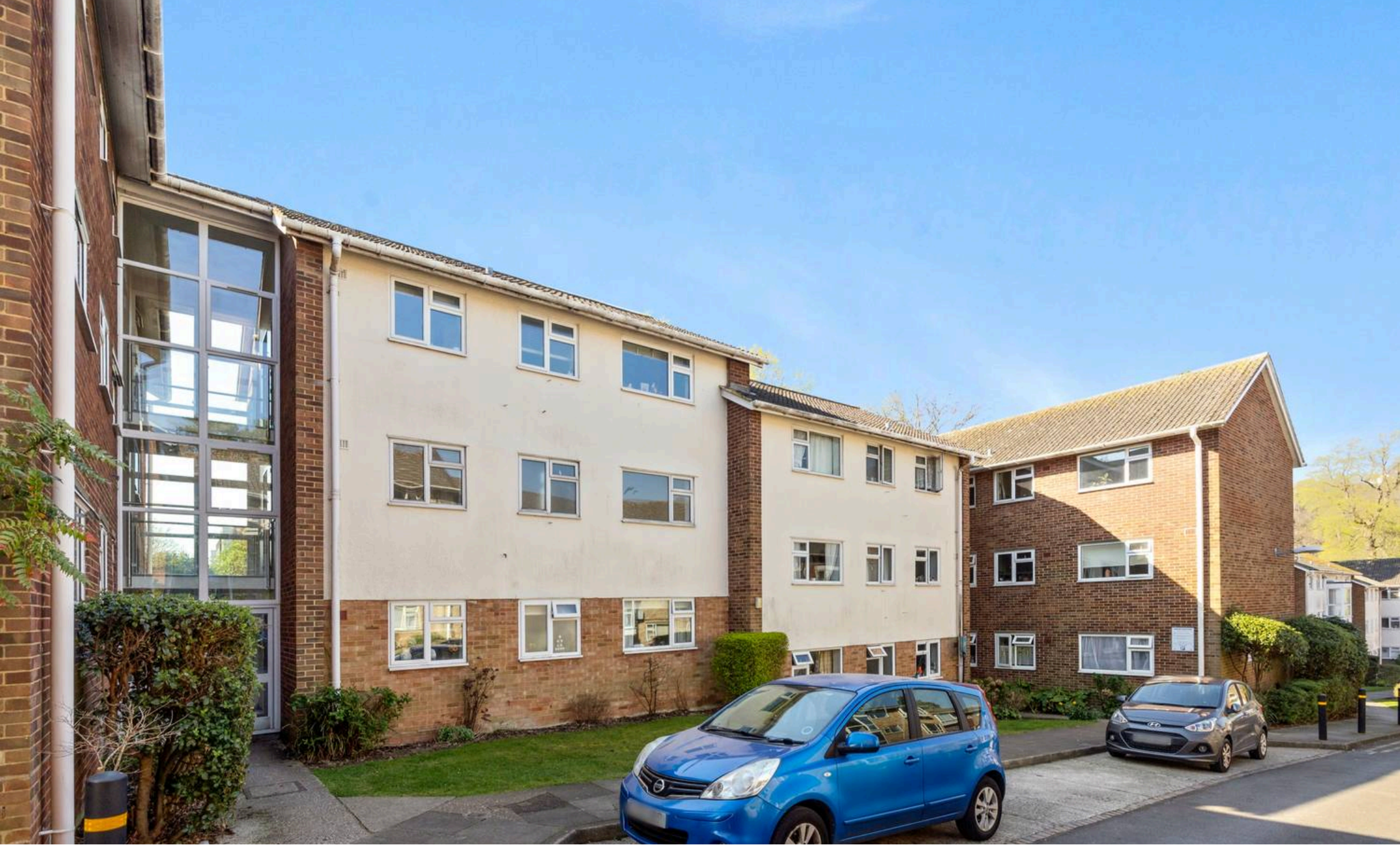
34 Cliveden Court Cliveden Close, Brighton bn1 6ud £1,600 pcm