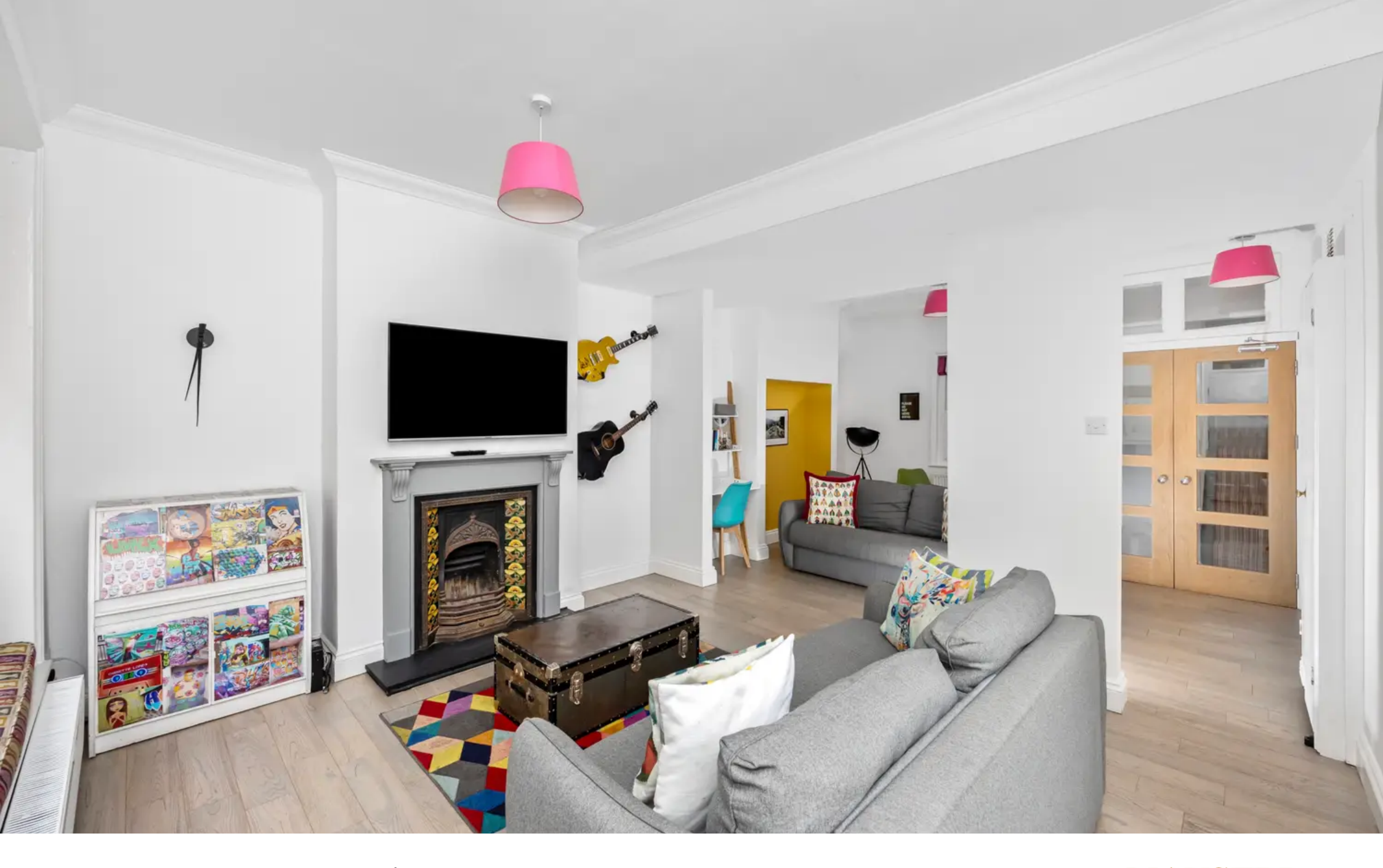
50 Regency Square, Brighton Offers Over £800,000