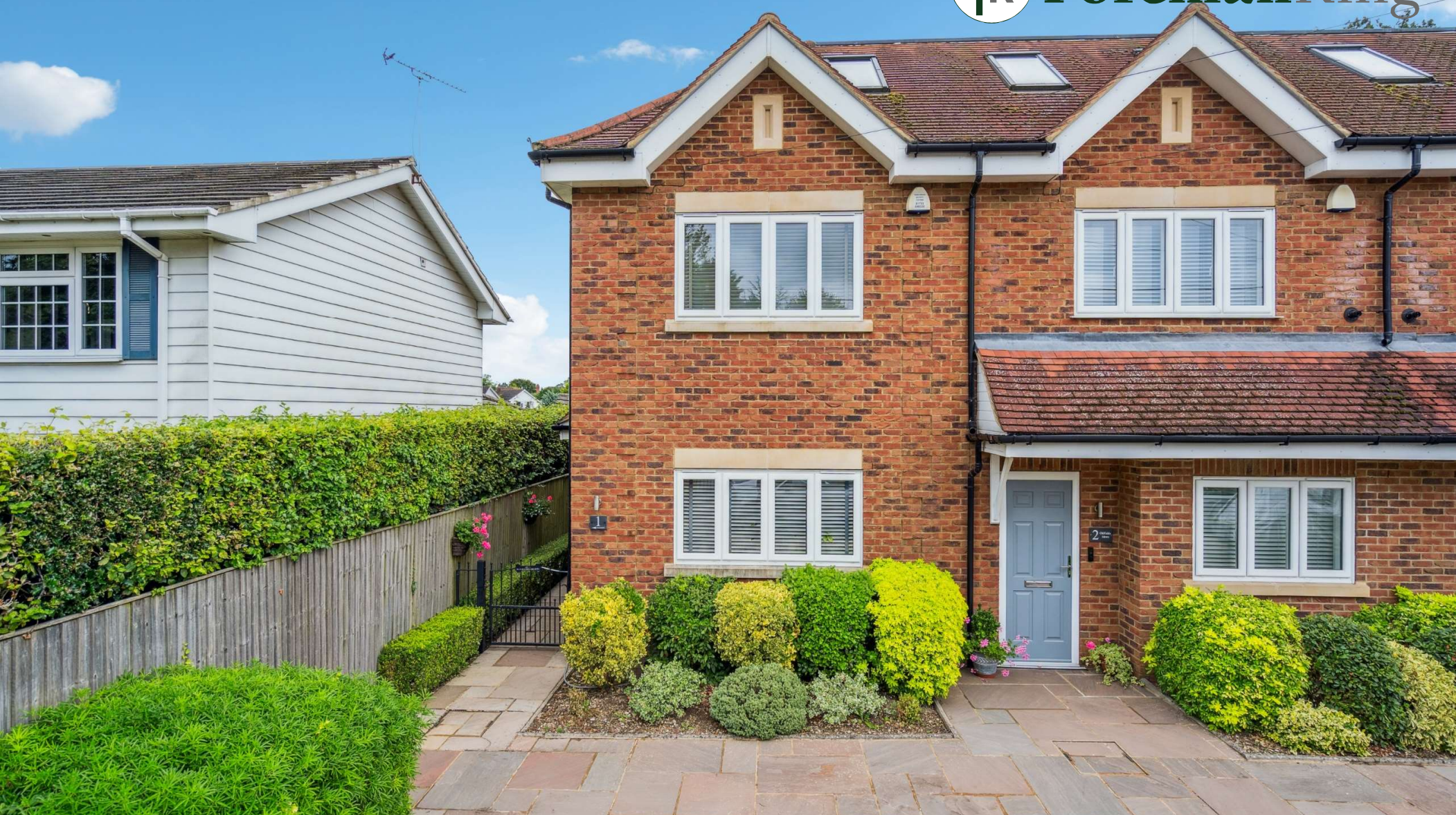
1 OLDFIELDS MEWS, BEACONSFIELD ROAD, FARNHAM COMMON, BUCKINGHAMSHIRE, SL2 3HP - £725,000 FREEHOLD