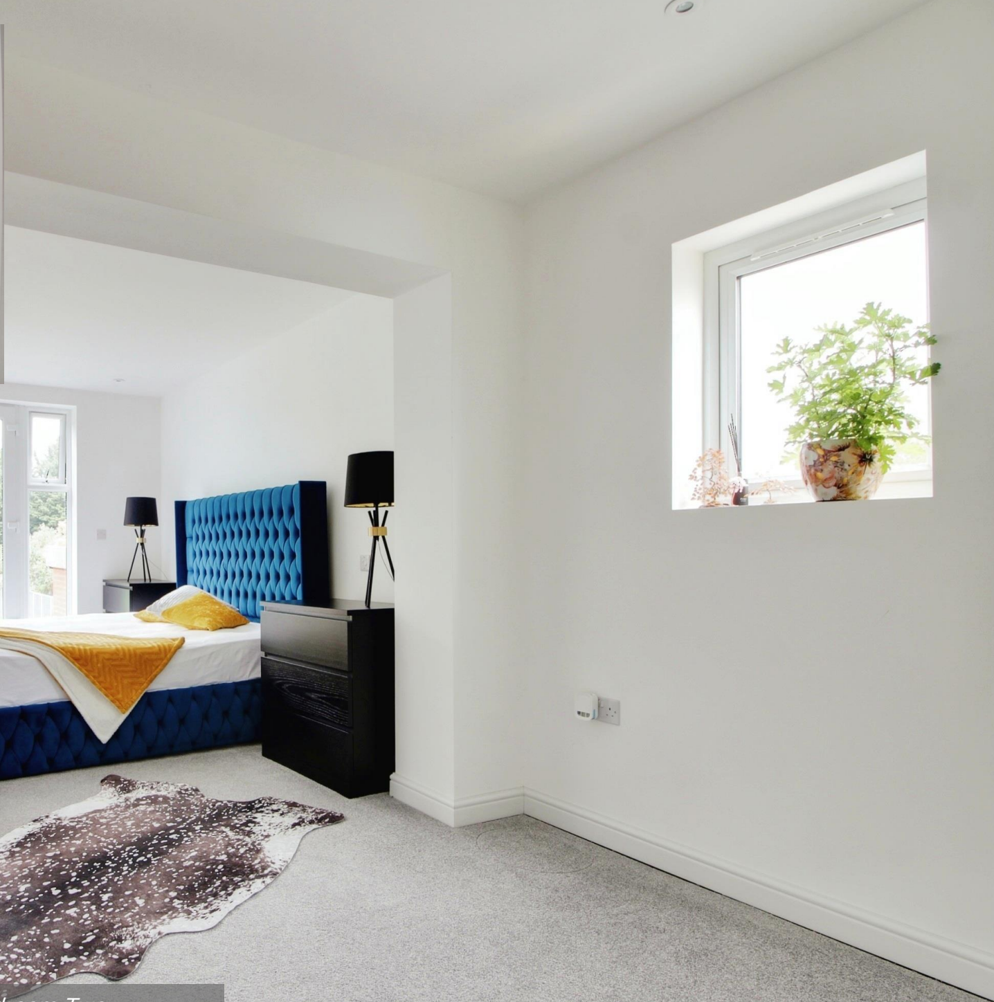
Substantial sized Bedroom One and Bedroom Two With Dressing Areas, Garden Views and En Suite to Bedroom One