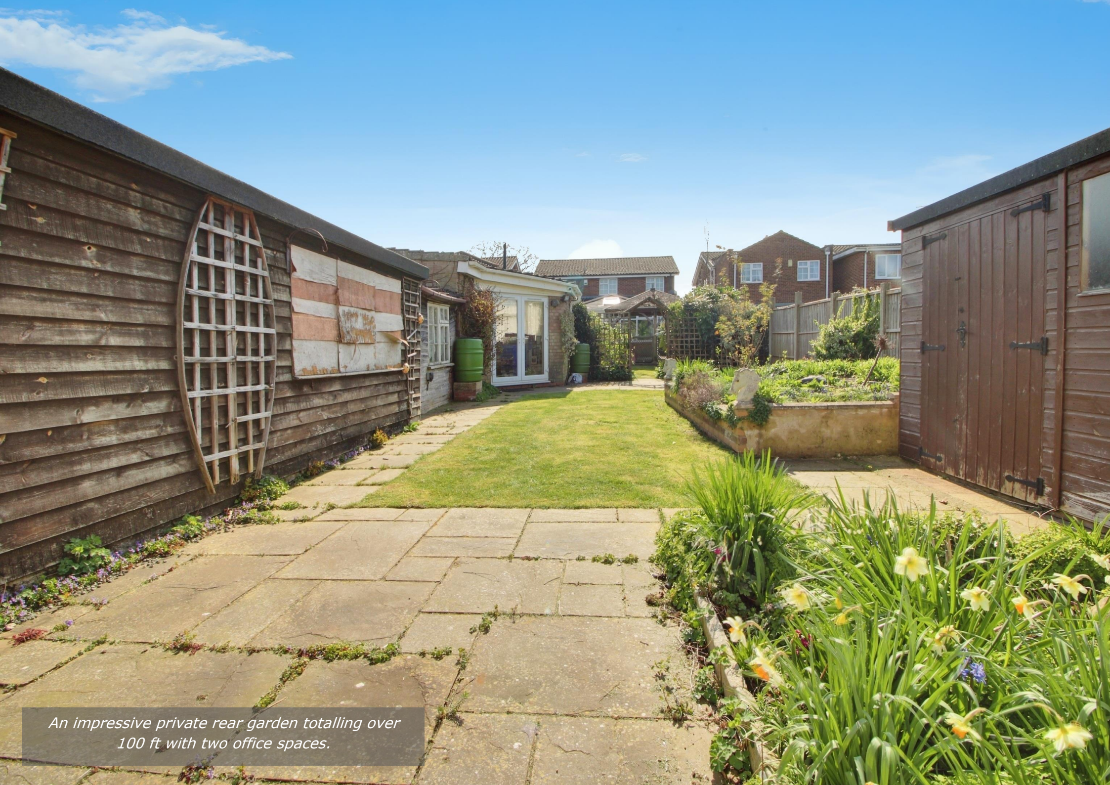
An impressive private rear garden totalling over 100 ft with two office spaces.