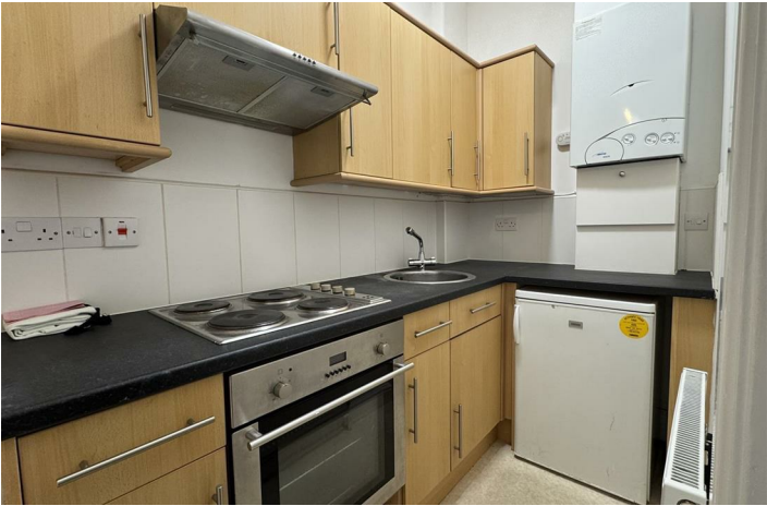
THIRD FLOOR 237 sq.ft. (22.0 sq.m.) approx.

ENTRANCE HALL LIVING ROOM/BEDROOM 3.66 x 3.26 (12'0" x 10'8") Murphy bed. KITCHEN 2.65 x 1.18 (8'8" x 3'10") BATHROOM 2.65 x 1.13 (8'8" x 3'8")