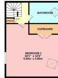
2ND FLOOR 561 sq.ft. (52.1 sq.m.) approx.