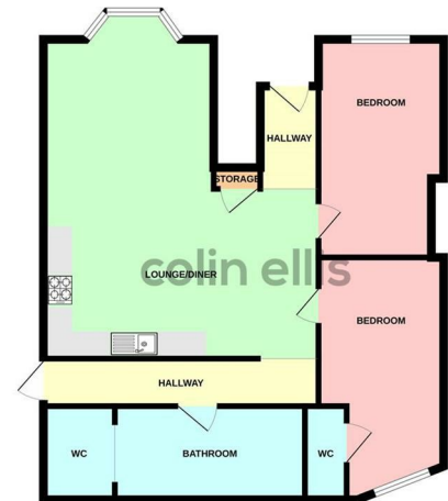
TOTAL FLOOR AREA: 801 sq.ft. (74.5 sq.m.) approx. While every attempt has been made to ensure the accuracy of the foregoing information, measurements of floor, window, doors and any other parts are approximate and no responsibility is accepted for any errors or omissions. The layout, fixtures and appliances shown have not been used and the quantities are not guaranteed or warranted. Make well before 10/2/20.