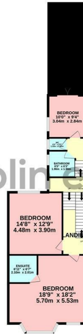
1ST FLOOR 804 sq ft, (74.7 sq m.) approx.