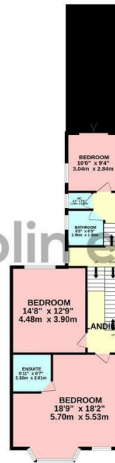
1ST FLOOR 804 sq ft, (74.7 sq m.) approx.