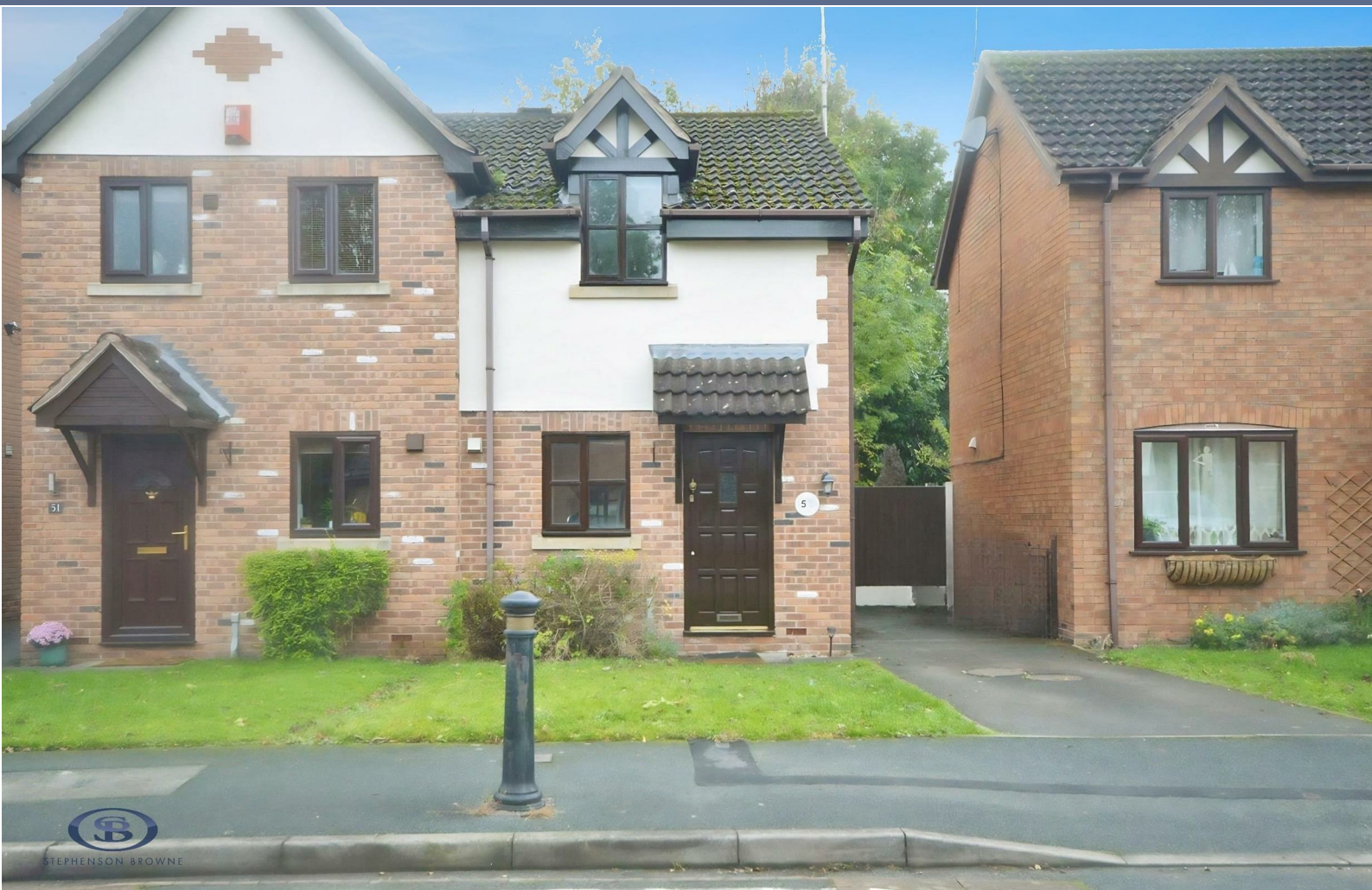
Danebower Road Trentham,