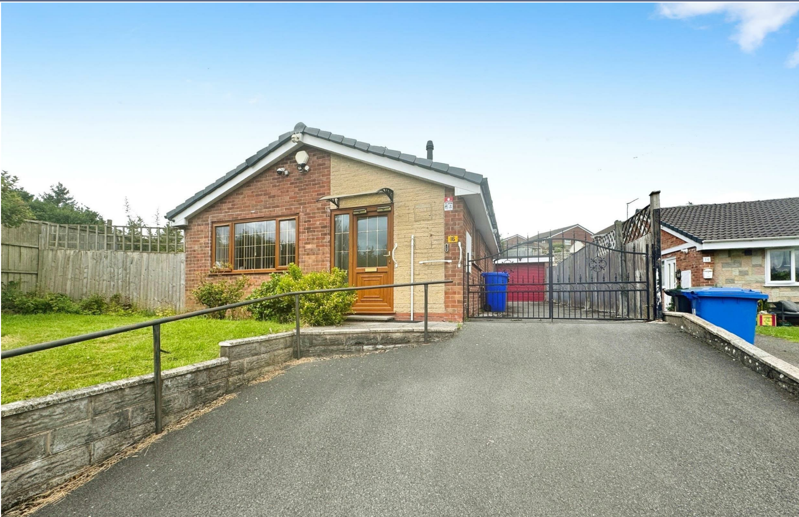
Westmorland Close Biddulph