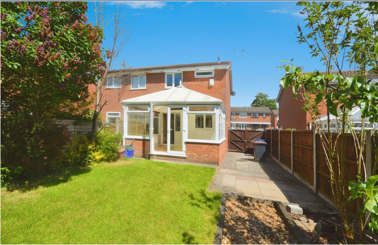
Darsham Gardens Westbury Park