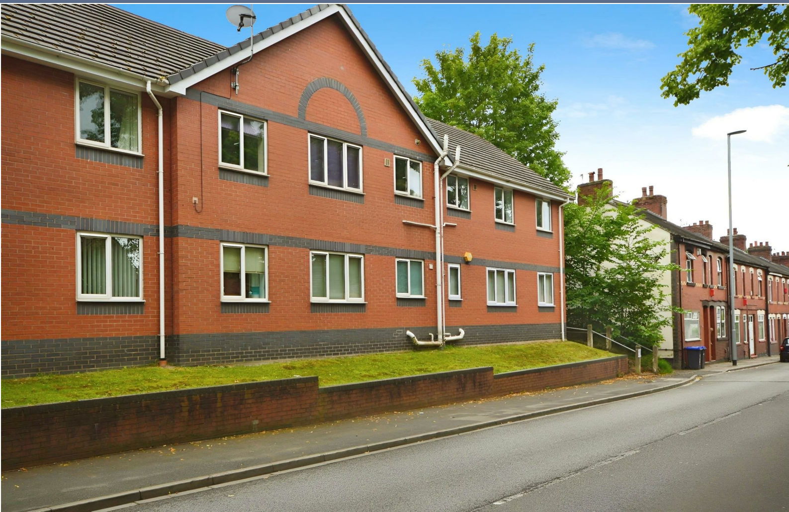
Parklands Leek Road