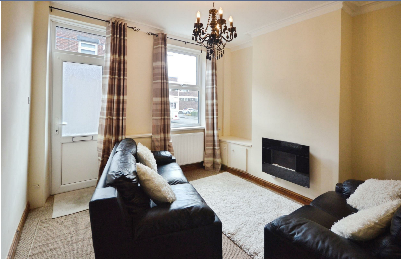
Stedman Street Birches Head