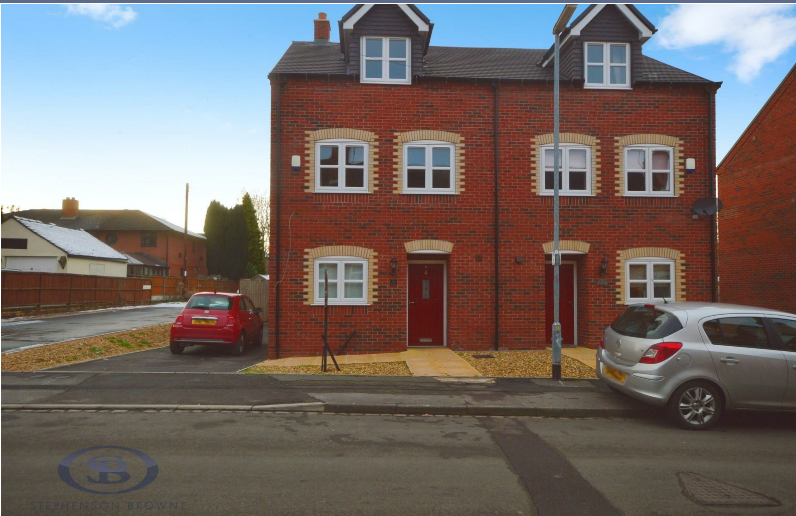
Silk Court Kinsey Street