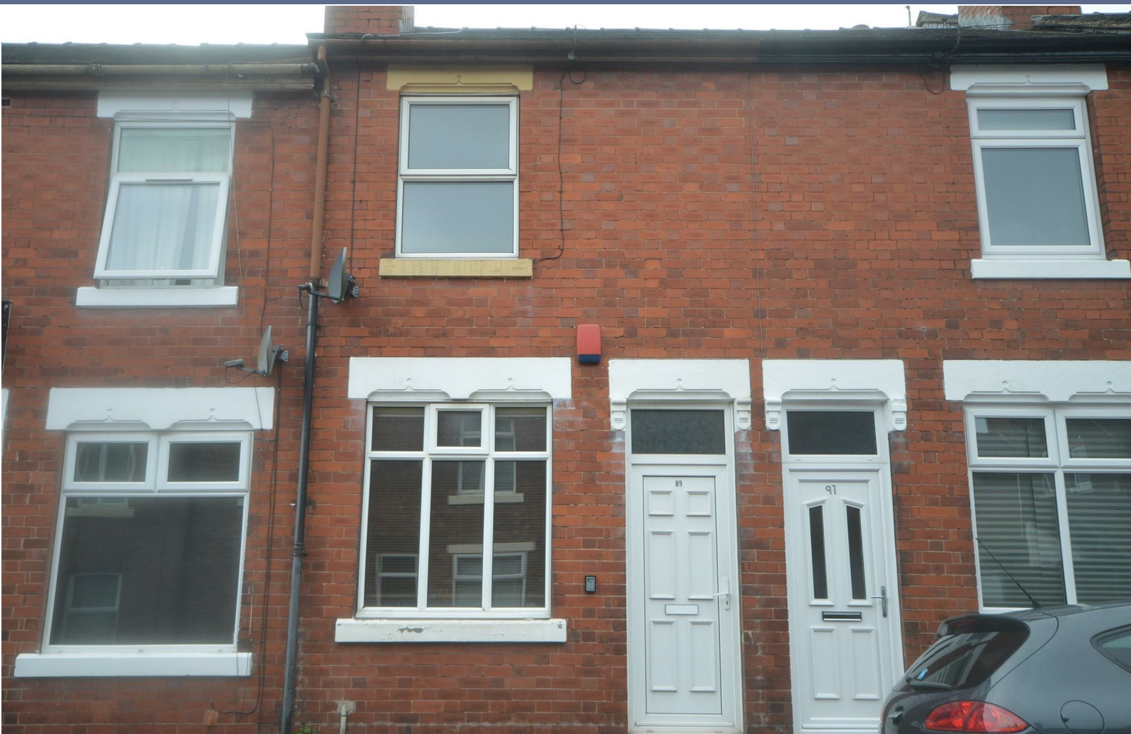
Langley Street Basford