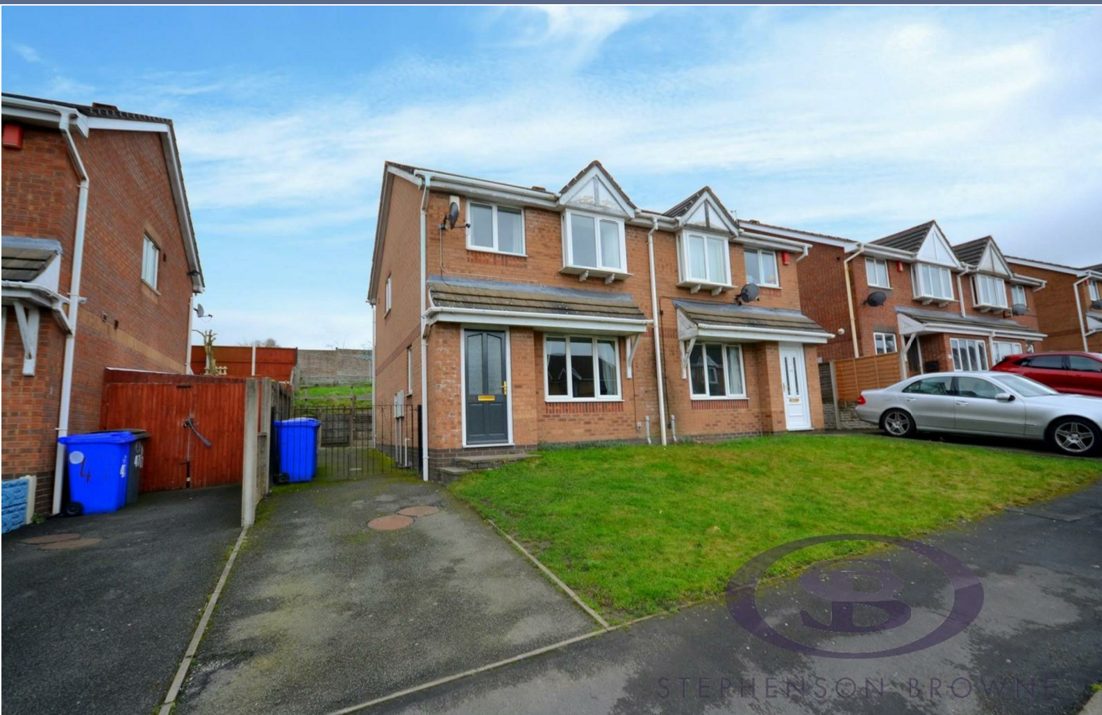
Menai Grove Longton