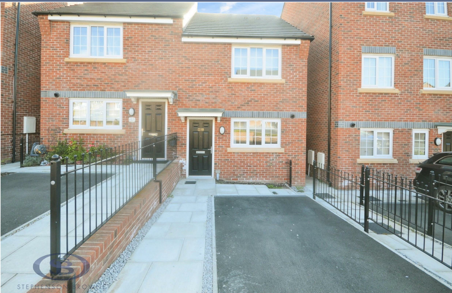
Ludlow Street Hanley