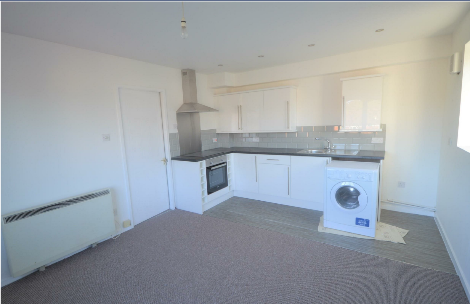
Kingfisher Close Madeley