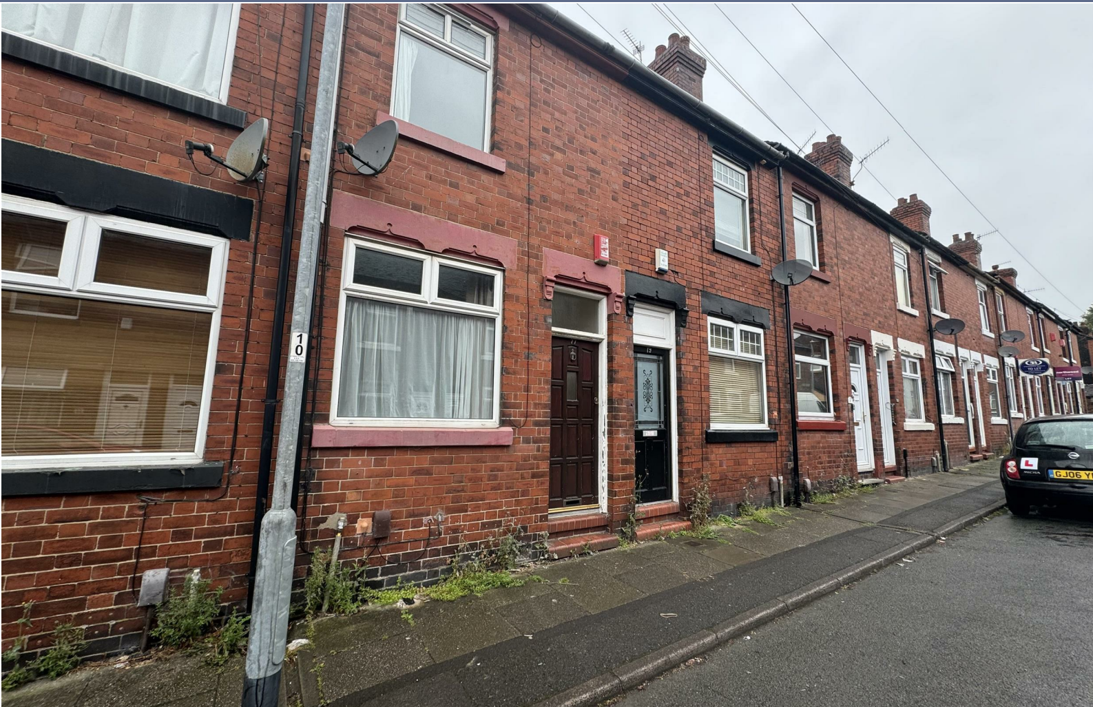
Langley Street Hartshill