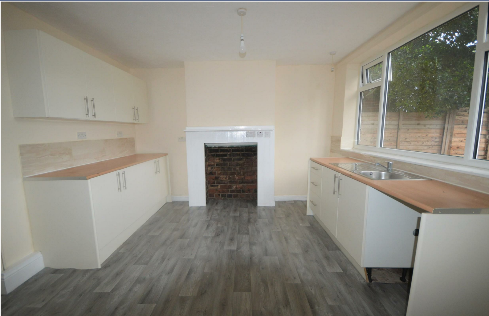
Newlands Street Shelton