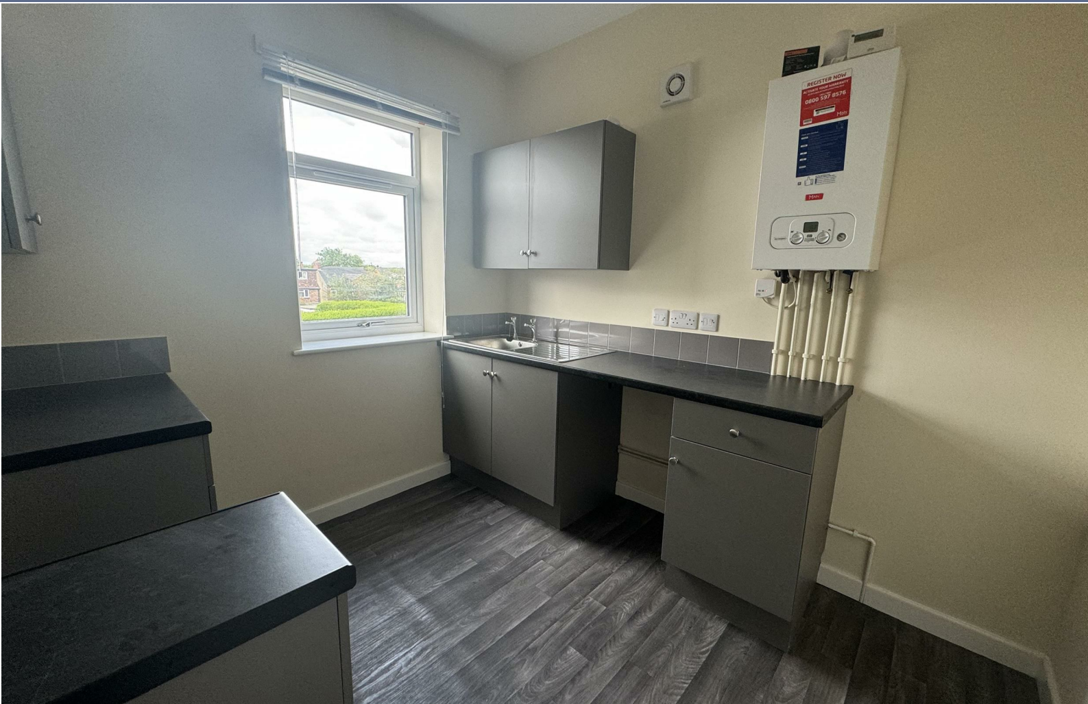
Dimsdale Parade East (Upstairs)