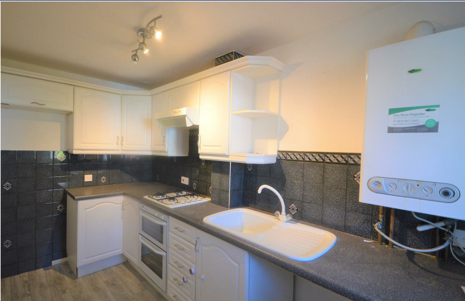
Summerhill Drive Waterhayes