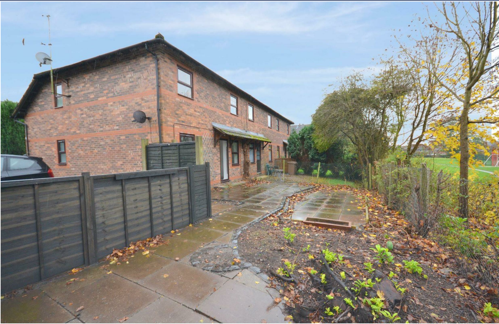
Maryfield Walk Penkull