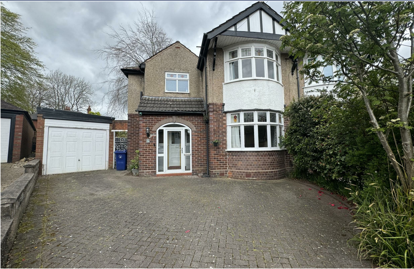
The Grove The Westlands