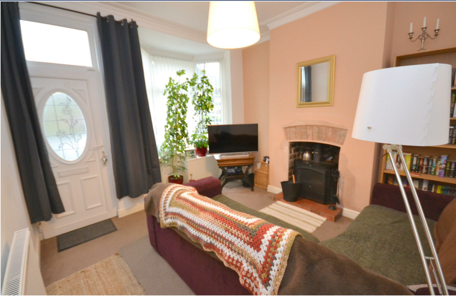
Eastbourne Road Northwood