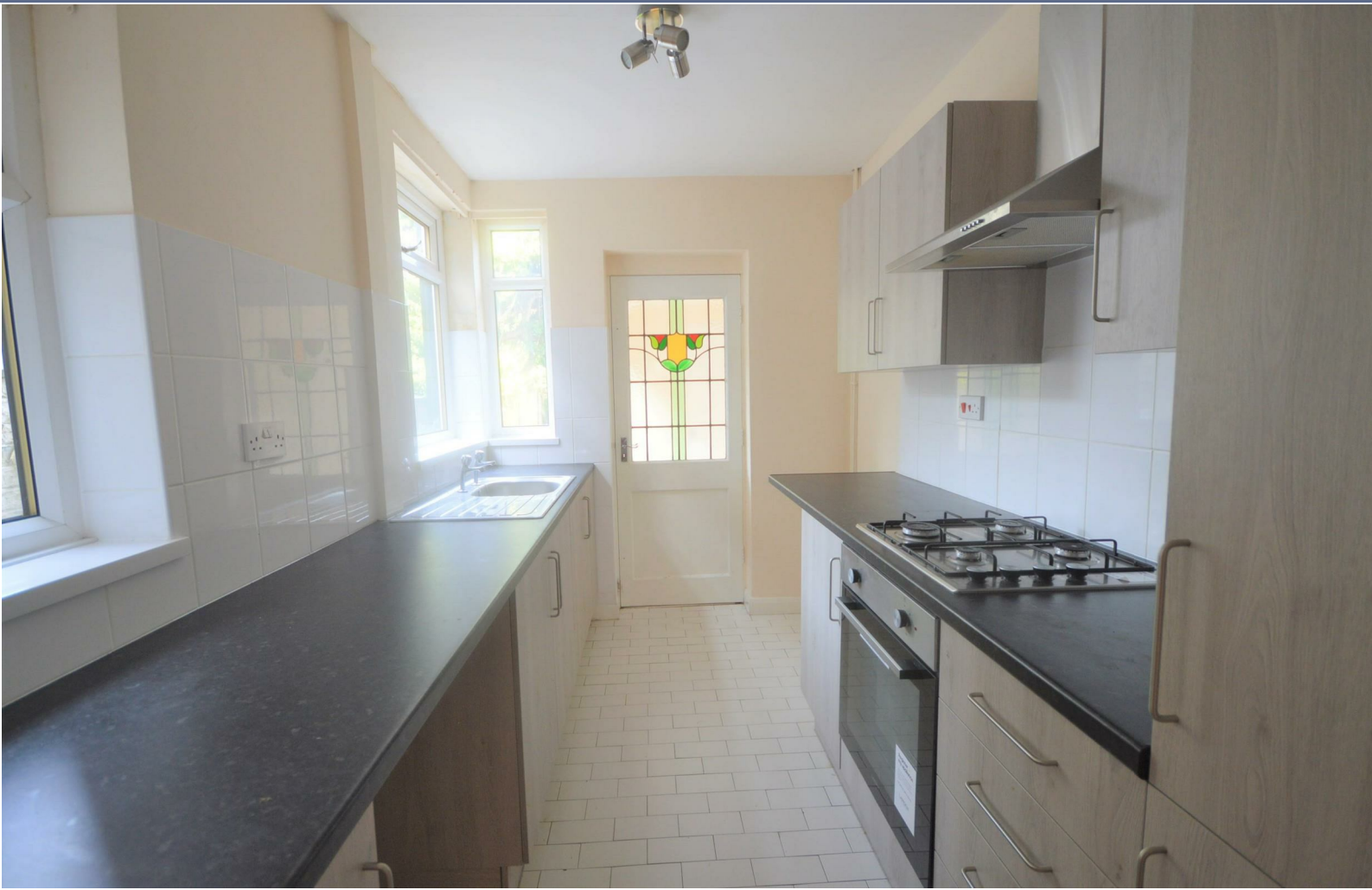
Kimberley Road Newcastle-Under-Lyme