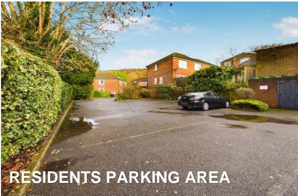
RESIDENTS PARKING AREA