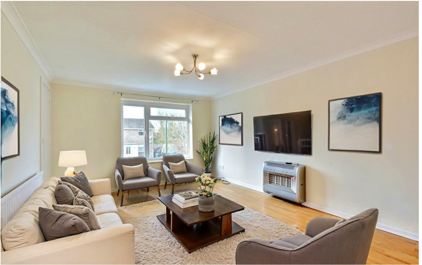
A spacious two bedroom maisonette with a garage.

Situated in this popular and convenient residential location, readily accessible for a variety of local shops and amenities including schools and transport links this great property is considered an ideal opportunity for cash cash buyers.