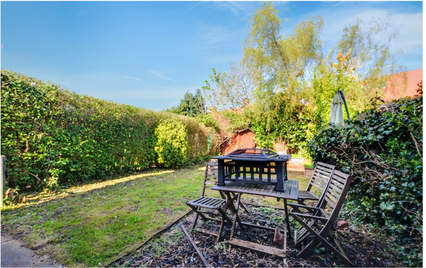
A two bedroom end terrace house.

Situated in this popular and convenient residential location, readily accessible for a range of local shops and amenities including schools, transport links, Nottingham University and Queens Medical Centre, this fantastic property is considered an ideal opportunity for a variety of potential purchasers including first time buyers, young professionals, families and investors.