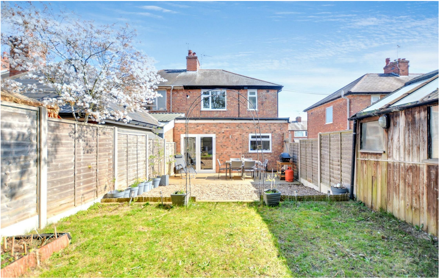
An extended and particularly well-presented semi-detached house.

Offering a bright and contemporary interior, incorporating a particularly appealing open plan kitchen/diner and living area to the rear with utility off and three good size bedrooms, this versatile home is likely to be of great appeal to a variety of potential purchasers.