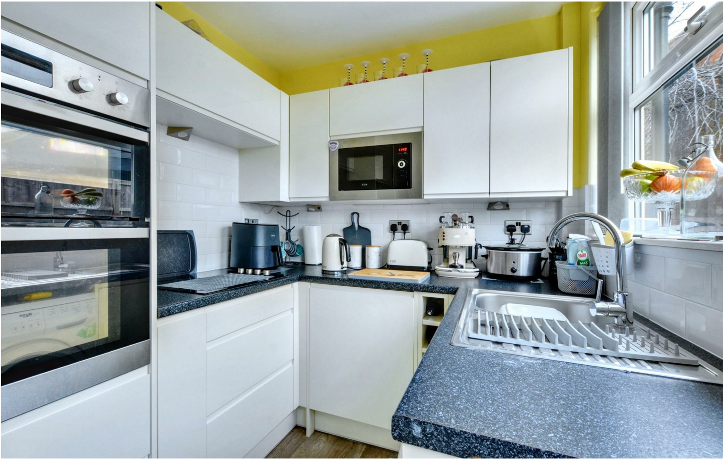
A traditional three-bedroom detached house.

Situated in this sought-after and well-established residential location, just a short distance from a variety of local shops and amenities including schools, transport links, Beeston Town Centre, and Chilwell Retail Park, this fantastic property is considered an ideal opportunity for a range of potential purchasers including first time buyers, young professionals and families.