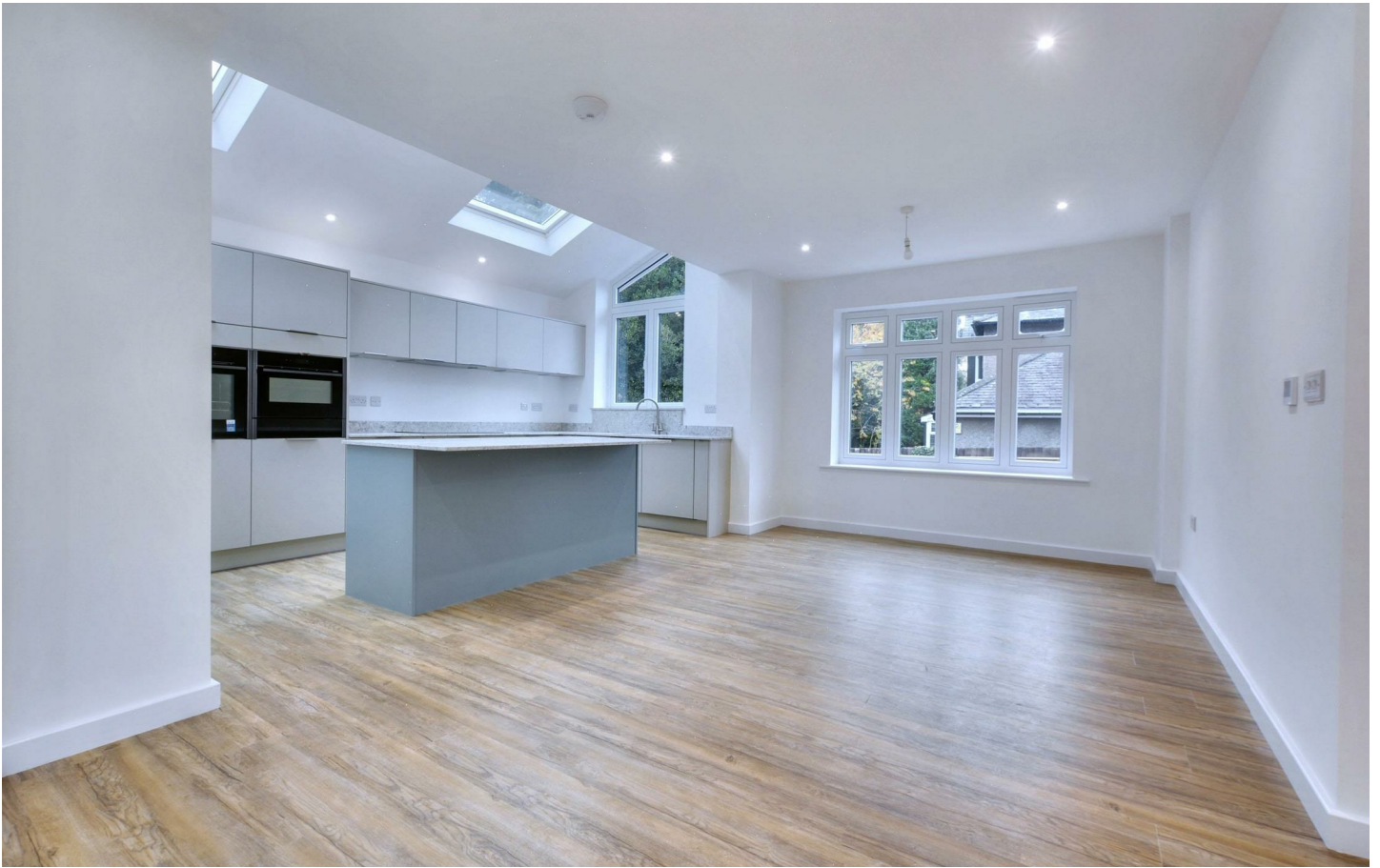
An individual and beautifully crafted four bedroom detached house.

Behind this traditional and attractive façade lies a stunning living space, that has been comprehensively remodelled and extended. With a particularly impressive open plan kitchen diner, feature Velux windows and patio doors, this excellent house offers all the benefits of modern living.