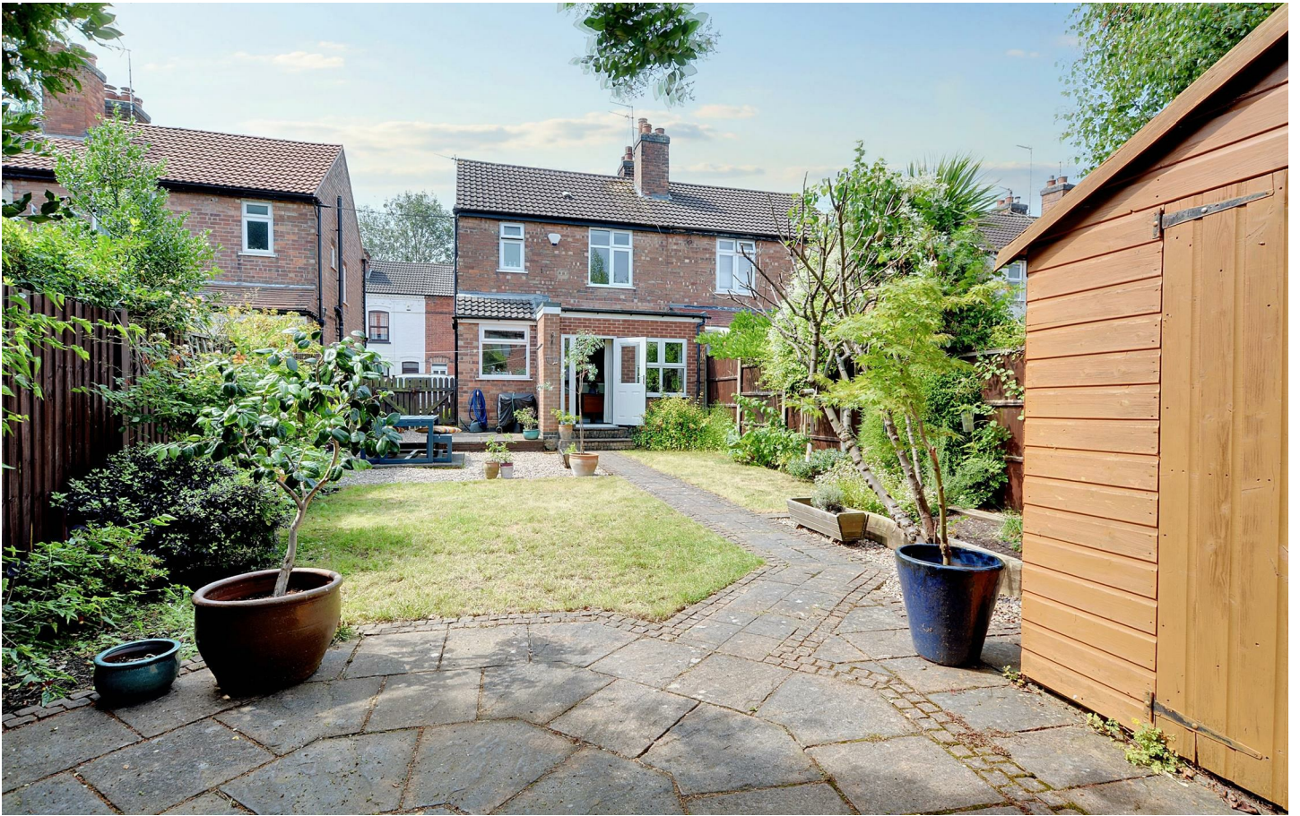
A traditionally styled and constructed, extended three-bedroom, 1930's semi-detached house.

Having been well maintained and upgraded by the current vendor, this excellent house benefits from an open plan kitchen diner and utility to the rear.