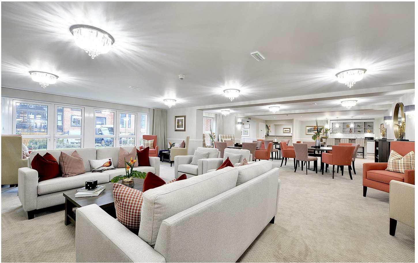
Apartment 34 – one bed second floor apartment with walk in shower, East facing.

We are pleased to present this brand new retirement development Gilbert Lodge. The Development includes a communal Owners' Lounge and Coffee Bar, landscaped gardens, regular events and a Lodge Manager Monday to Friday to be on hand and act as a friendly neighbour. Beeston High Street is less than 2 minutes from Gilbert Lodge, and a tram stop is just outside for easy access to Nottingham City Centre meaning everything you need is right on your doorstep.