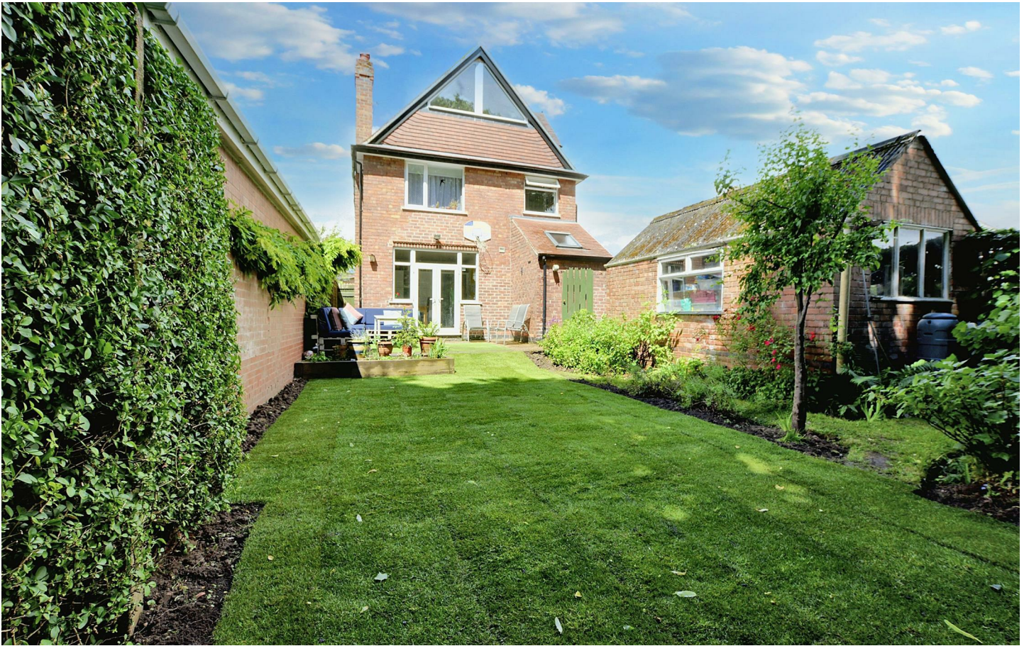
A four bedroom detached house with a garage.

Situated in this sought-after and convenient residential location, within easy reach of a variety of local shops and amenities, including: schools, transport links, Beeston Town Centre and the A52 and M1, this fantastic property is considered an ideal opportunity for a range of potential purchasers including: young professionals and families.