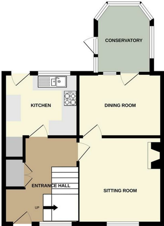
GROUND FLOOR 478 sq.ft. (44.4 sq.m.) approx.