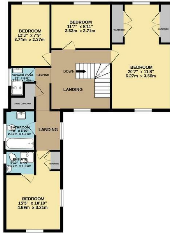
1ST FLOOR 891 sq.ft. (82.8 sq.m.) approx.