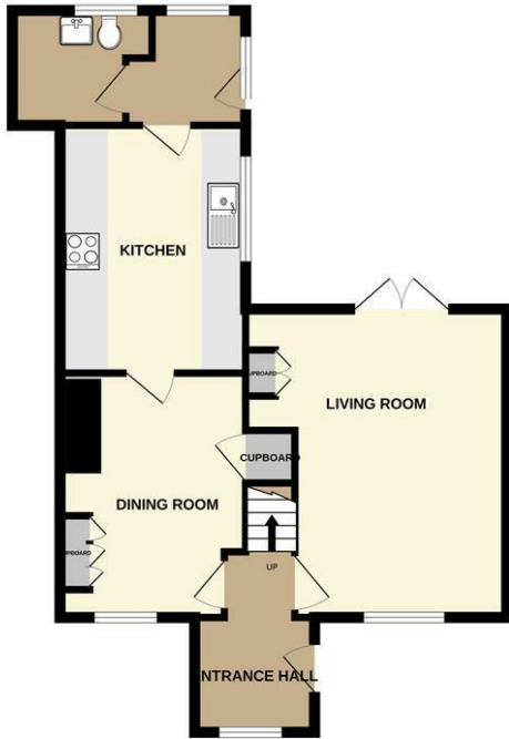
GROUND FLOOR 759 sq.ft. (70.5 sq.m.) approx.