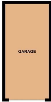
TOTAL FLOOR AREA : 1242 sq.ft. (115.4 sq.m.) approx.

Whilst every attempt has been made to ensure the accuracy of the floorplan contained here, measurements of doors, windows, rooms and any other items are approximate and no responsibility is taken for any error, omission or mis-statement. This plan is for illustrative purposes only and should be used as such by any prospective purchaser. The services, systems and appliances shown have not been tested and no guarantee as to their operability or efficiency can be given. Made with Metropix ©2023