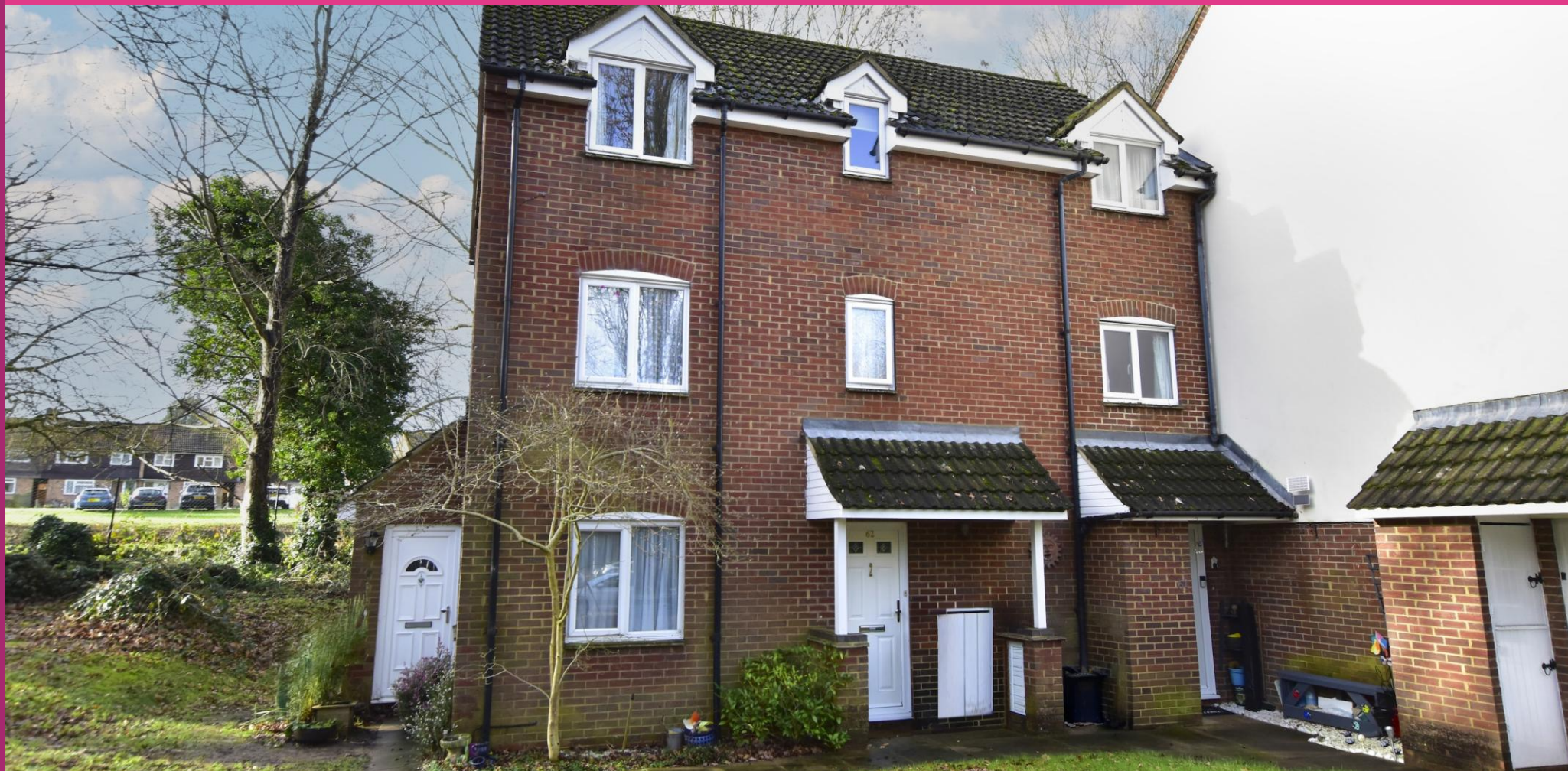
RAVENS CROFT, WATFORD - £250,000 2 Bedroom Maisonette