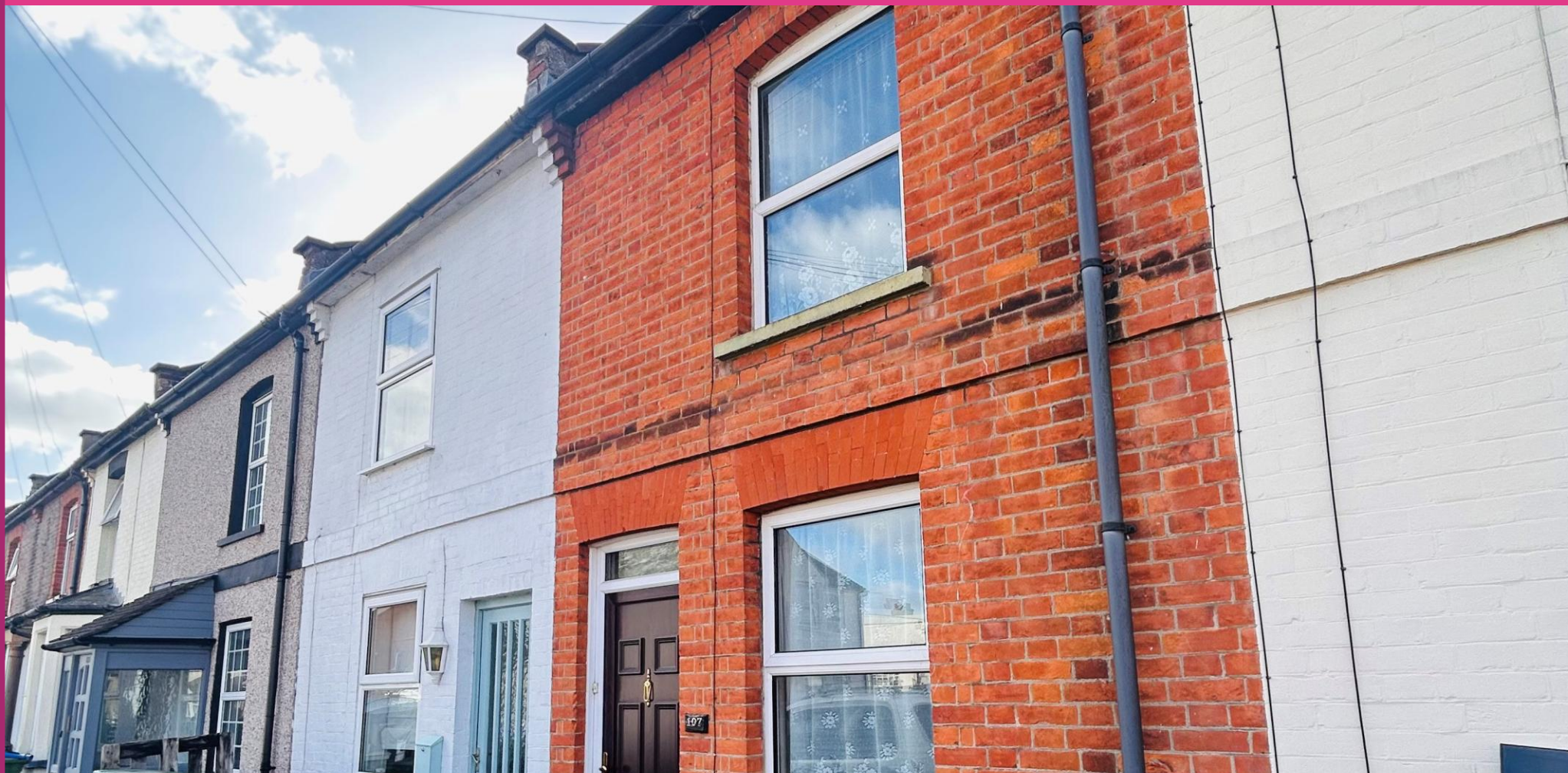
CECIL STREET, WATFORD - £350,000 2 Bedroom Mid Terraced House