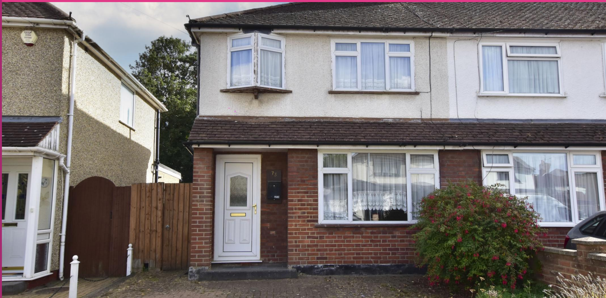
FERN WAY, WATFORD - £470,000 3 Bedroom End Terraced House