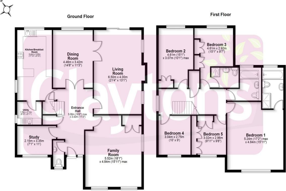
Total area: approx. 214.6 sq. metres (2309.7 sq. feet)