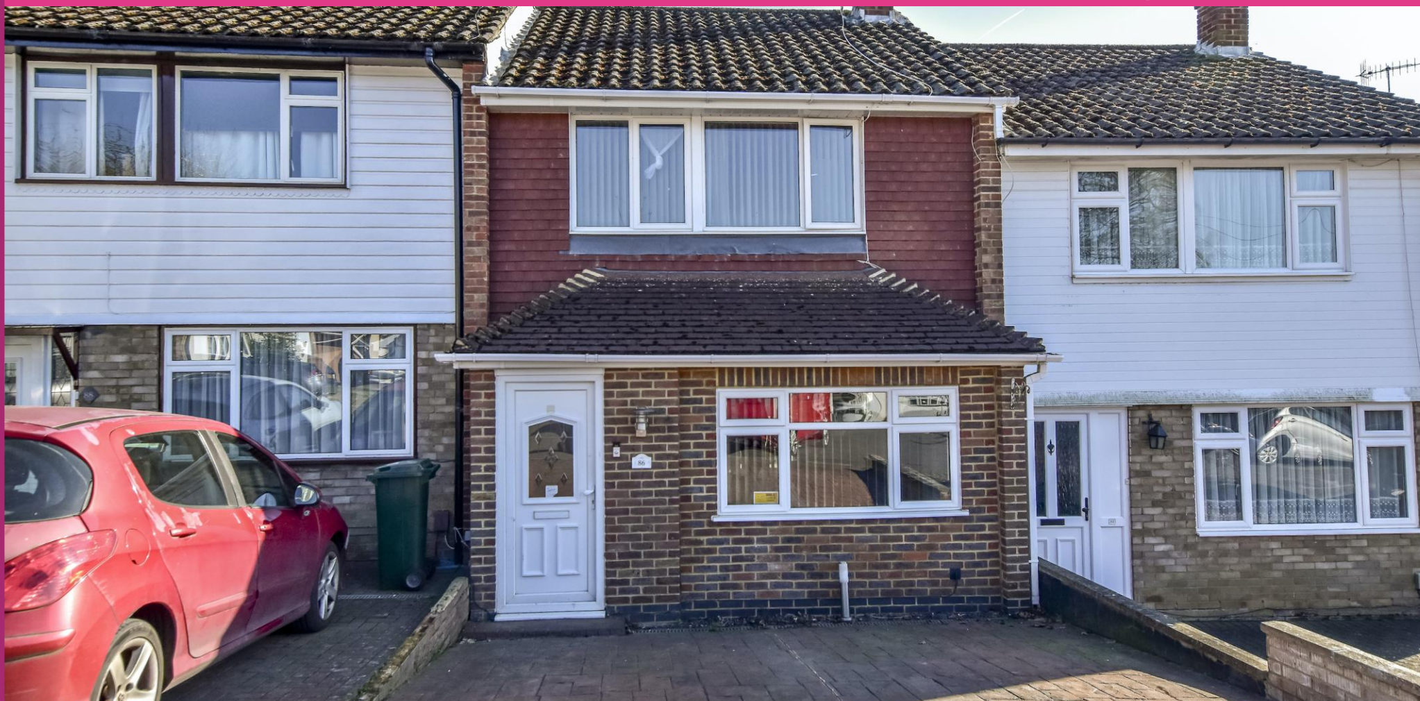
MUTCHETTS CLOSE, WATFORD - £475,000 3 Bedroom Mid Terraced House