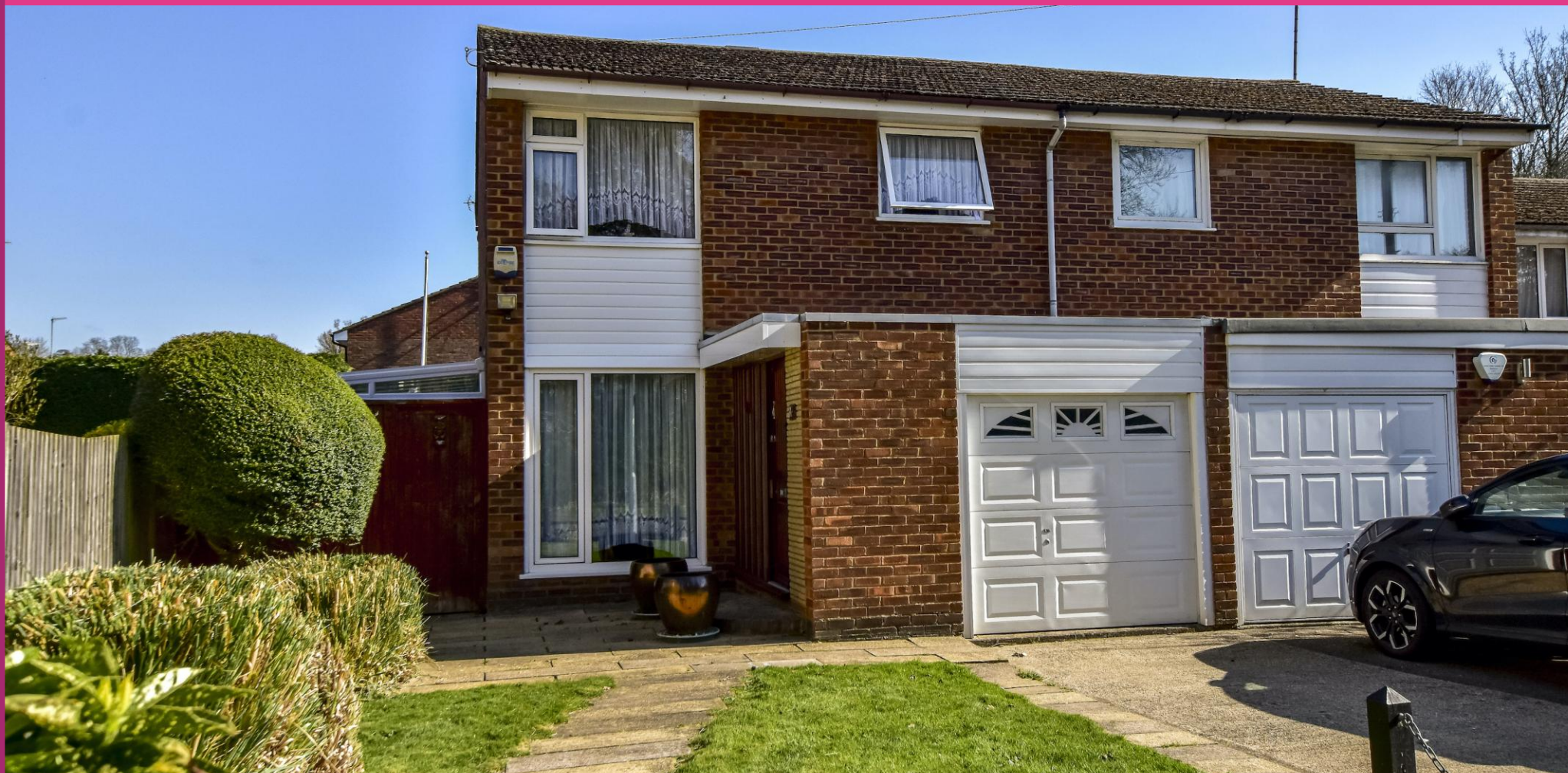
FALCON WAY, WATFORD - £487,250 3 Bedroom Semi-Detached House