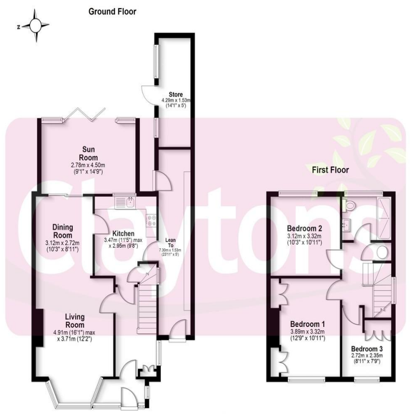
Total area: approx. 117.8 sq. metres (1268.4 sq. feet)

FOR ELIUSTRATIVE PURPOSES ONLY - NOT TO SCALE - The position and size of doors, windows, appliances and other features are approximate only. Total area includes garages and outbuildings - # My Home Property Marketing - Unsultanized reproduction prohibited. Plan produced using Plancip.