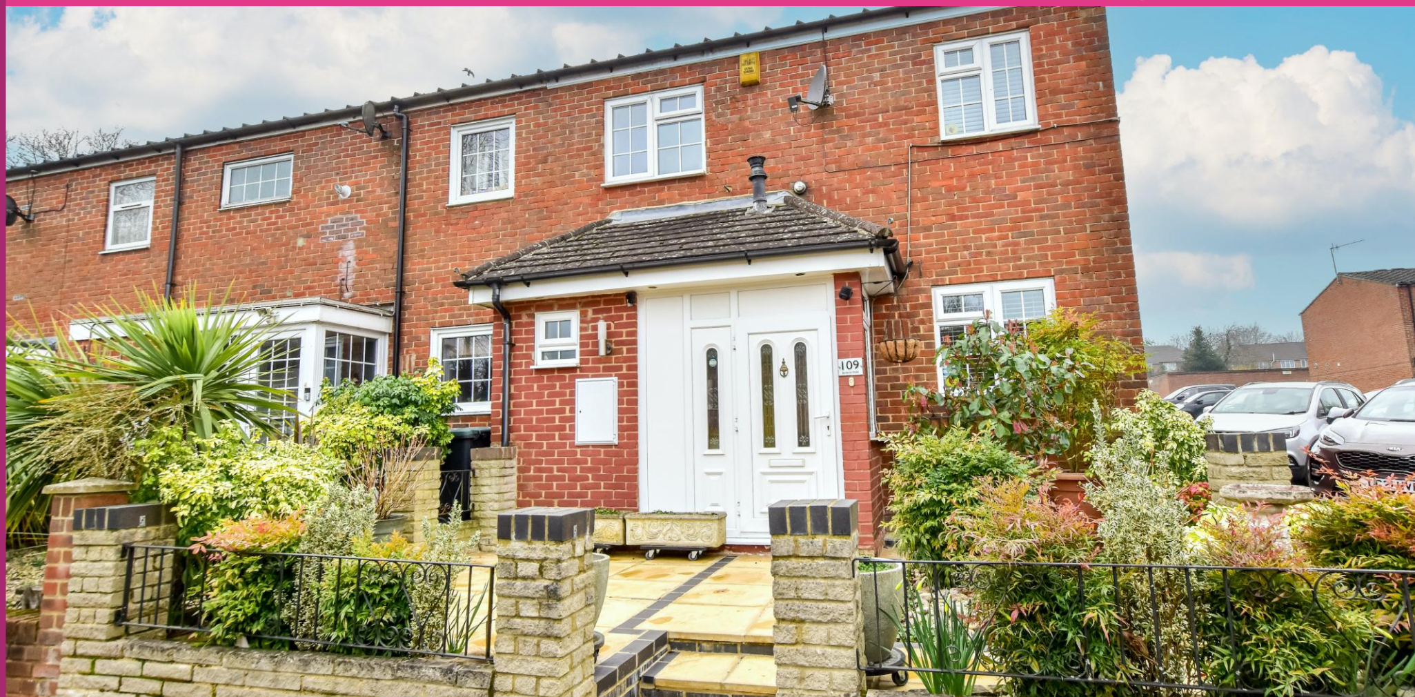
JACKETTS FIELD, ABBOTS LANGLEY - £450,000 3 Bedroom End Terraced House