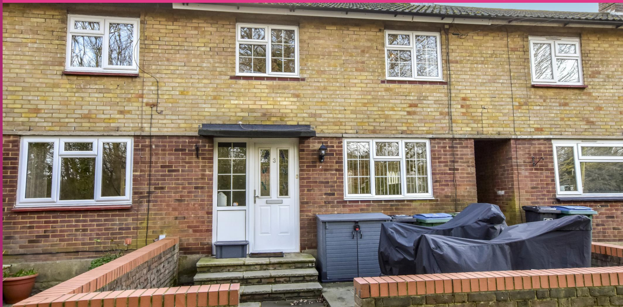
THE GOSSAMERS, WATFORD – OIEO £465,000 3 Bedroom Mid Terraced House