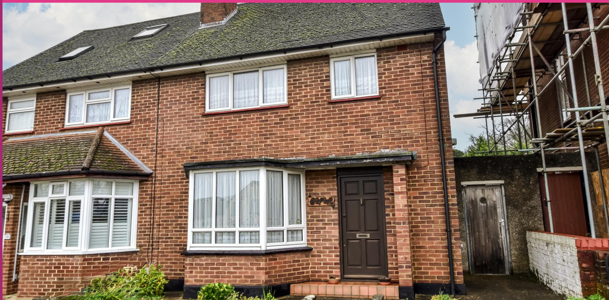
SHEEPCOT LANE, WATFORD - £475,000 3 Bedroom Semi detached house